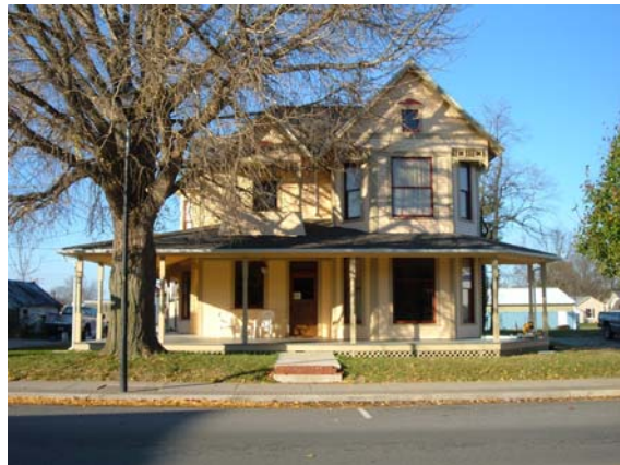
FOR SALE c.1895 Griffitt-Murphy House, Morgantown