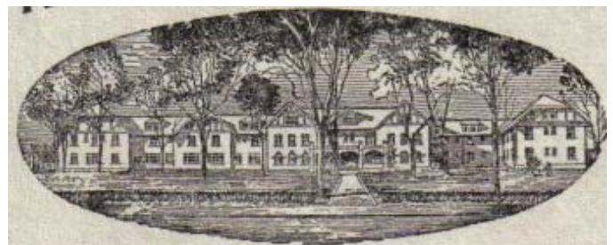
The main (east) elevation of the Martinsville Sanitarium as it appeared on stationary letterhead about 1930. The Sanitarium faces the Vandalia Depot and is linked to it by the brick walk. The grand lawn has remained the same since 1882, the year the original sanitarium was established.