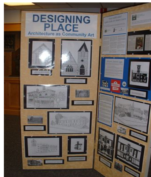
Display panel at fine arts exhibition

In order to fund this second phase of the project, MCHPS has submitted an application for a 2005-2006 Historic Preservation Education Grant, a joint effort of Historic Landmarks Foundation of Indiana and the Indiana Humanities Council. We seek to hire a designer, to develop a power point presentation and website so the course can be shared with and replicated by other teachers in the district, county and state, and beyond.