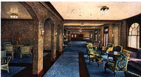
Sunroom and lobby looking north.

W. A. Kennedy purchased the Sanitarium in 1918 and renamed it Martinsville Mineral Springs. Between 1925 and 1927, Kennedy had the sanitarium completely rebuilt. The new, English Tudor style sanitarium extended from Harrison Street to Pike Street, housed 150 guests, and had an interior design that featured stained glass windows; floors covered with hardwood, ceramic tile and velvet carpets; a mahogany staircase; crystal light fixtures; and an immense sunroom.