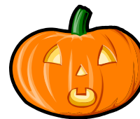
Carve a Halloween jack-o'-lantern.

Plowing and incorporating organic matter in the fall avoids the rush of garden activities and waterlogged soil in spring. Fall-prepared soils also tend to warm faster and allow earlier planting in spring.